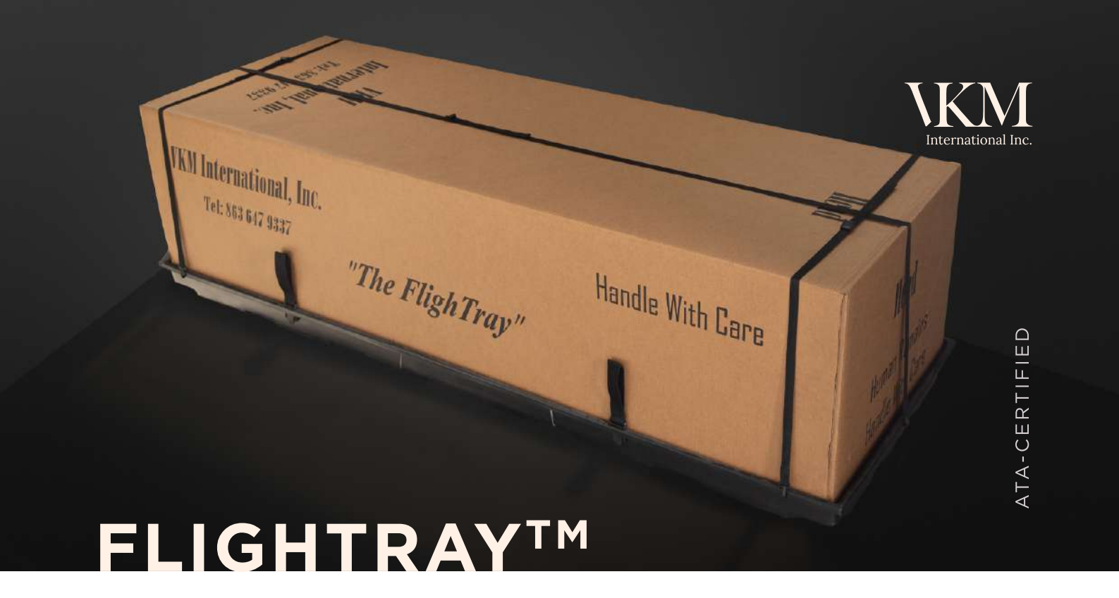
Our lightweight, reusable flight container for dignified transport

Our newest addition, the reusable FlighTray <sup>TM</sup>, permits the secure and dignified transport of a burial casket containing human remains via air.